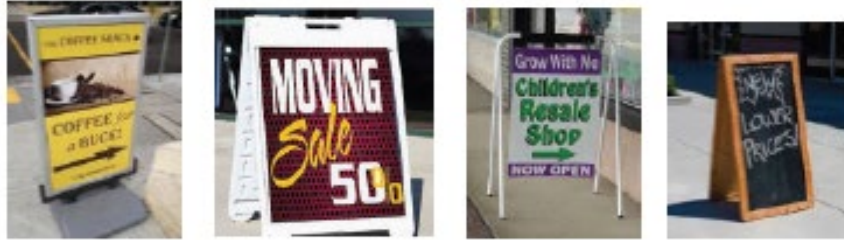
Table 16 Sidewalk Signs