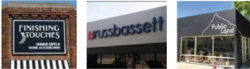
Table 17 Wall Signs