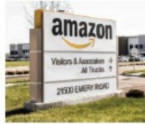
Table 12 Monument Signs