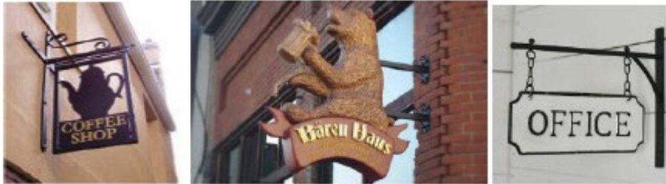
Table 15 Projecting Signs