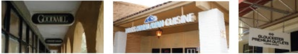
Table 11 Hanging Signs