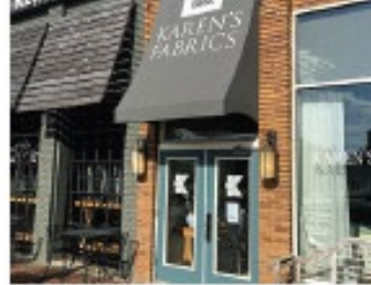
Table 7 Canopy and Awning Signs