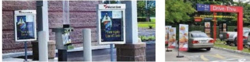
Table 9 Drive-Through Signs