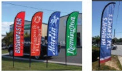
Table 5 Blade Signs