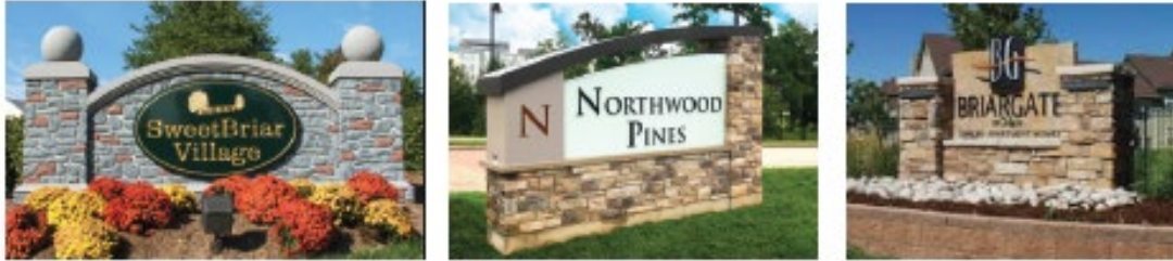
Table 10 Entry Signs