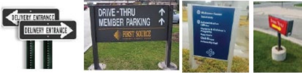
Table 8 Directional Signs