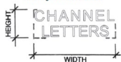
FIG. 3 Sign Face Area—Letters