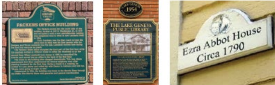
Table 6 Building Markers