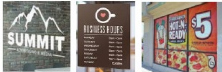
Table 18 Window Signs