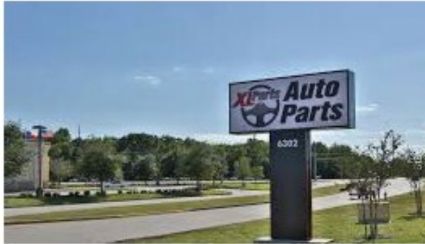
Table 13 Pole Signs