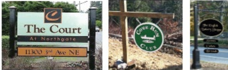
Table 14 Post Signs