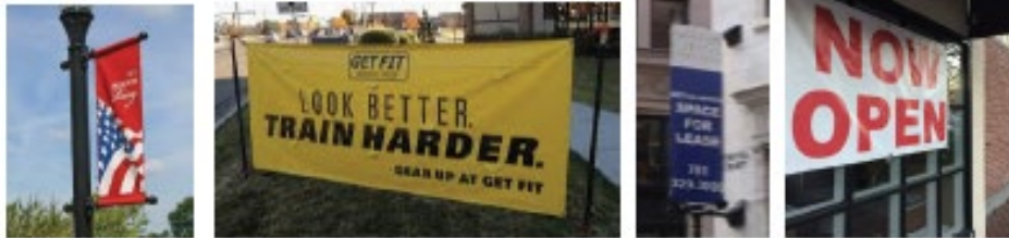
Table 3 Banner Signs

1. The following standards apply to banners: